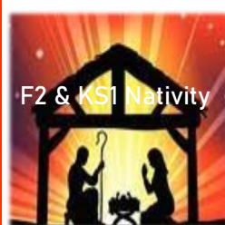
F2 & KS1 Nativity

On Tuesday 14th November we had a lovely remembrance service in church lead by Year 6. Each Class went up to the front of church and laid a wreath in remembrance of all those that sacrificed themselves for our country.